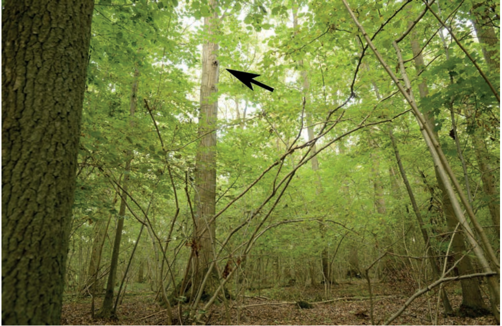
Figure 2. The Bechstein's bat roost (indicated by a black arrow) in a red oak and the surrounding mixed forest.