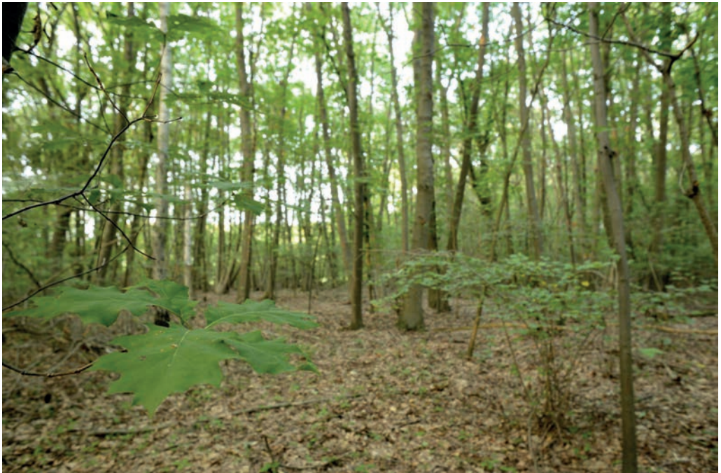
Figure 3. This monotonous stand of red oak in the Nietelbroeken is planned to be restored to a more diverse forest stand with native tree species.