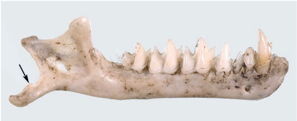
Figure 2. Skull and lower right mandible of a grey long-eared bat, found in a sample of barn owl pellets collected in Noord-Brabant at a farm near Luyksgestel in 2010. The arrow points at the dent on the processus angularis, absent in brown long-eared bats ( Plecotus auritus ).

of bats (from 1990 until now), the predation of bats by barn owls, as in other European countries, is likely to be very rare. This may partly be due to commonly-taken measures to keep birds, such as pigeons ( Columba sp.) and jackdaws ( Corvus monedula ) out of buildings. As a result barn owls (in Dutch: church owls) often cannot enter the lofts anymore